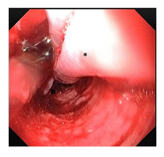
Fig.2 Endoscopic picture at mid esophagus level. Thin mucosal bridge (*) connecting proximal and distal mucosal tube (solid arrow). Note the large mucosal defect with cul de sac surrounding the mucosal tube

mycosis were ruled out. Patient had gained 5 kg of weight 6 months following surgery.